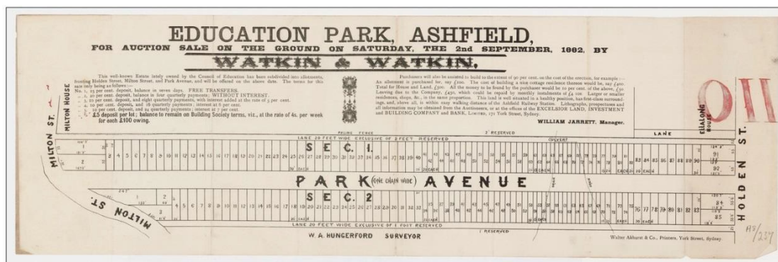
Above: 1882 Subdivision plan for Education Park, Ashfield